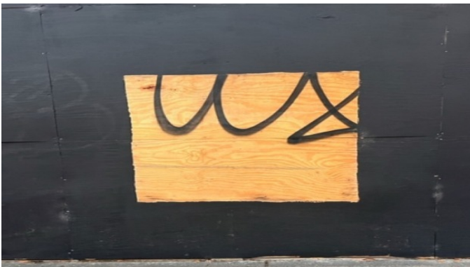
Graffiti on building.