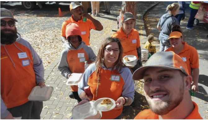
Ambassador team enjoys Grateful.