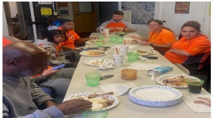
Ambassadors enjoy Thanksgiving lunch.