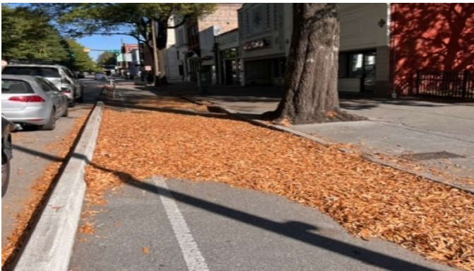
Bike lane Broad St.