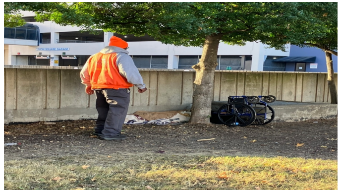
Hardy checks on an individual in need.