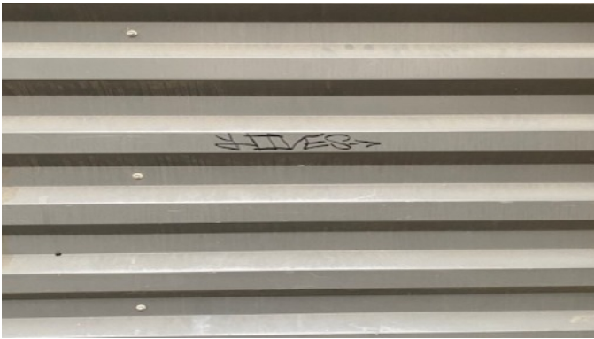
Graffiti on Broad St building.