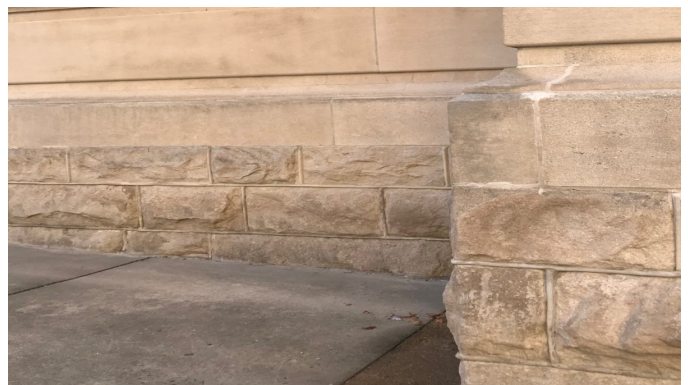
Trash bag removed from 8th St.