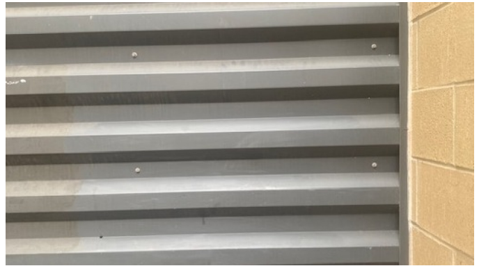
Graffiti removed from Broad St building.