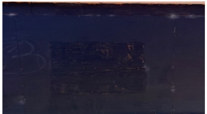
Graffiti covered up on building.