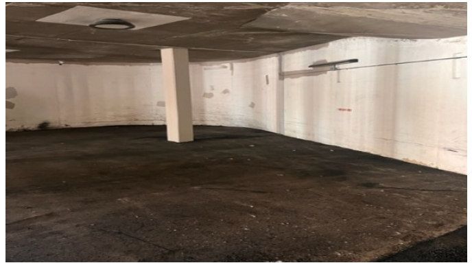
After photo of clothes picked up.