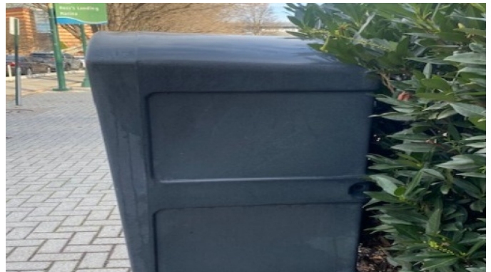
Graffiti removed from newspaper box.