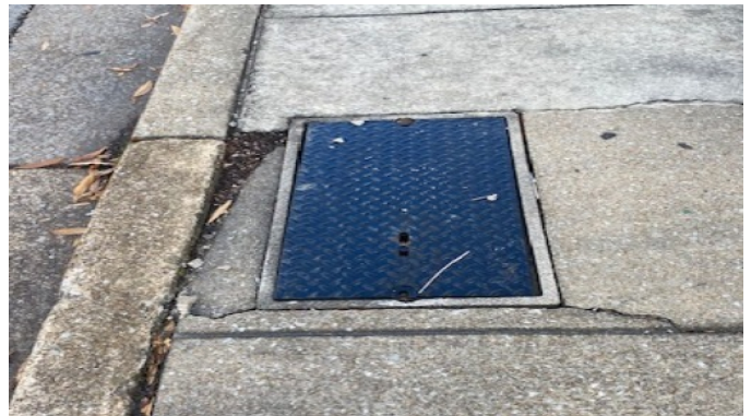
Cover fixed by EPB on Broad St.