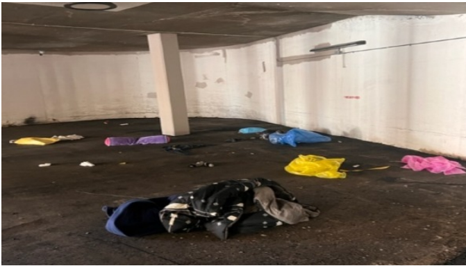
Before photo of clothes in parking garage.