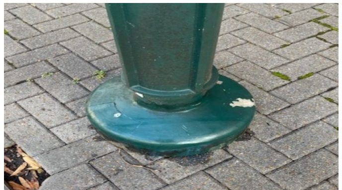
Graffiti removed from light pole.