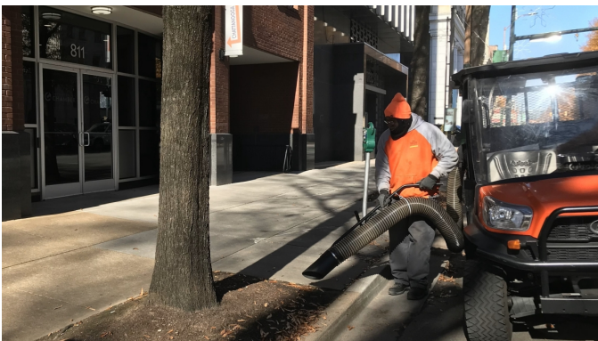
Hardy uses the leaf machine to clean up Broad St.