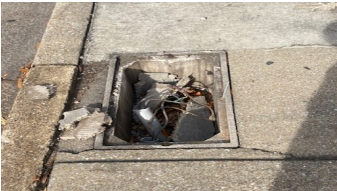
Broken electrical cover on Broad St.