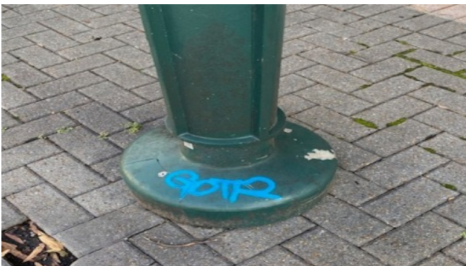
Before photo of graffiti on light pole.