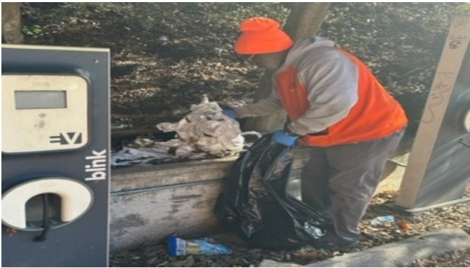
Hardy picks up trash left on Market St.