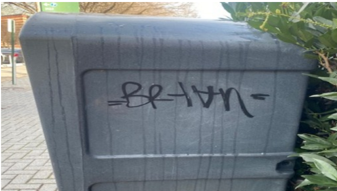
Graffiti on newspaper box.