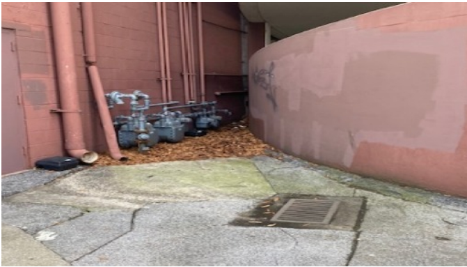
Before photo of leaves cleaned up on Broad St.