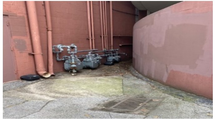
After photo of leaves cleaned up on Broad St.