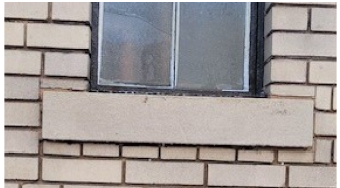
Graffiti removed from building Patten Parkway.