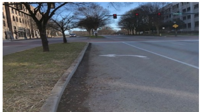
Curbline cleaned on 4th St.