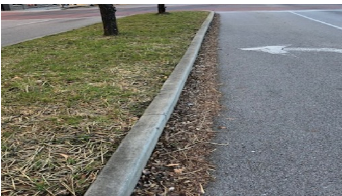
Before curbline cleaned on 8th St.