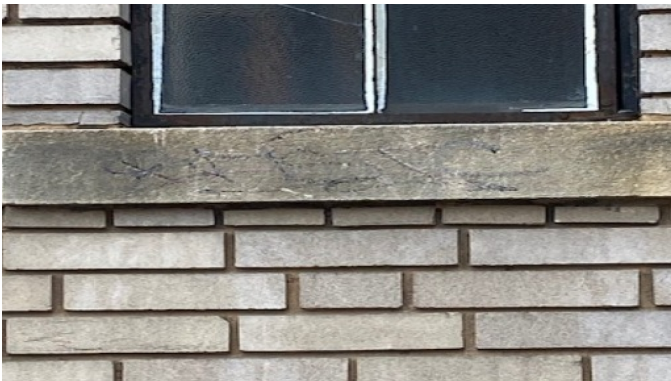
Graffiti on building Patten Parkway.