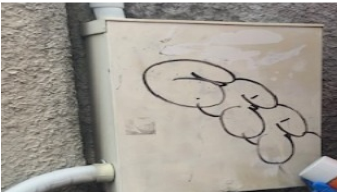
Graffiti on 8th St electrical box.