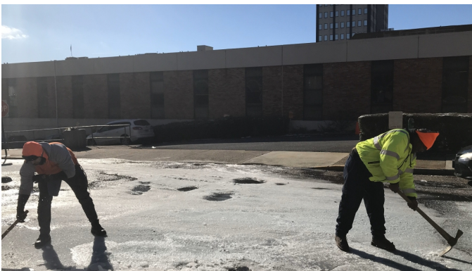
Jake breaks up ice on Walnut St.