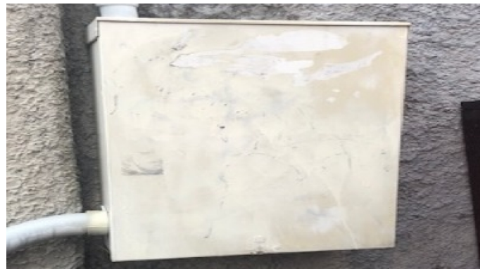
Graffiti removed from electrical box on 8th St.