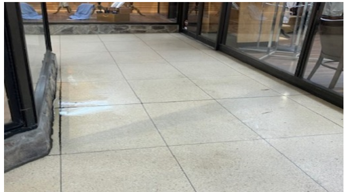
Biohazard cleaned up on Market St.