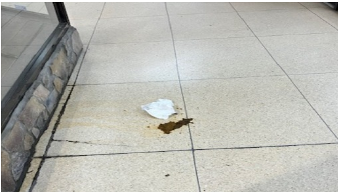
Biohazard on Market St.