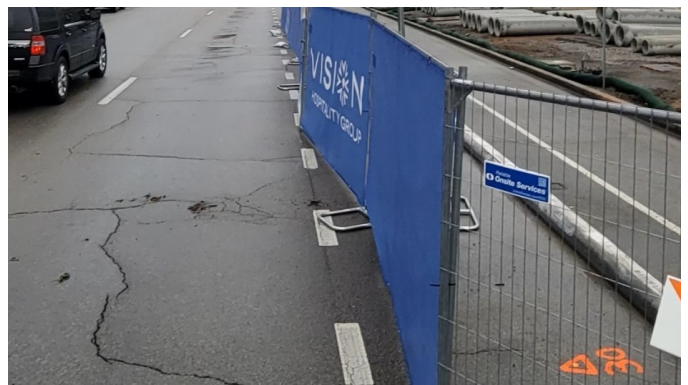
Fence set put back upright.