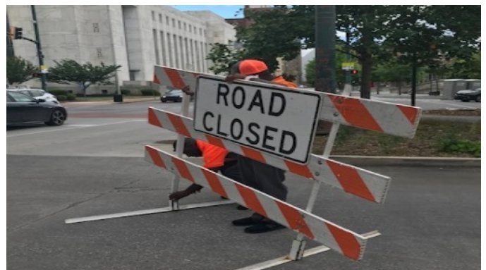
Ambassadors close down a street for an event.