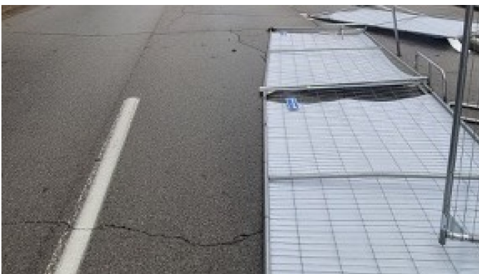
Fence knocked over on Broad St.