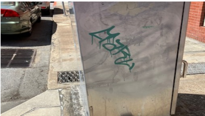
Graffiti on Cherry St.