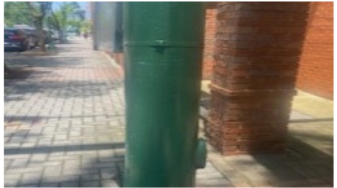
Graffiti removed from light pole.