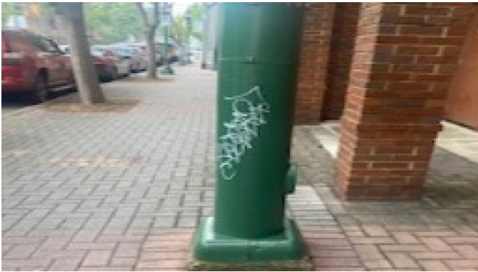
Graffiti on light pole.