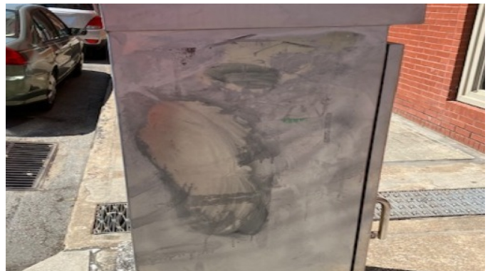
Graffiti removed from Cherry St.