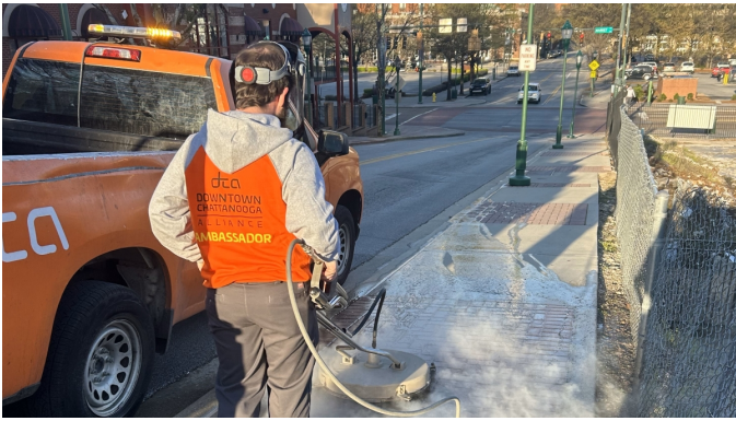
Colton power washes Aquarium Way.