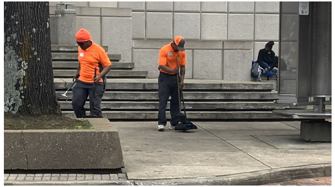
Ambassadors sweep up around the courthouse.