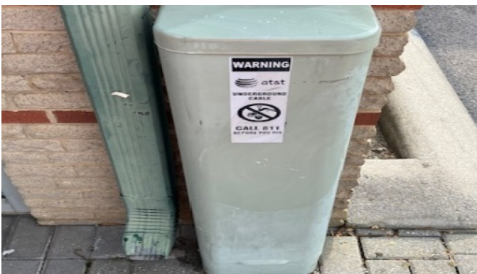
Graffiti removed from electric box on Market St.