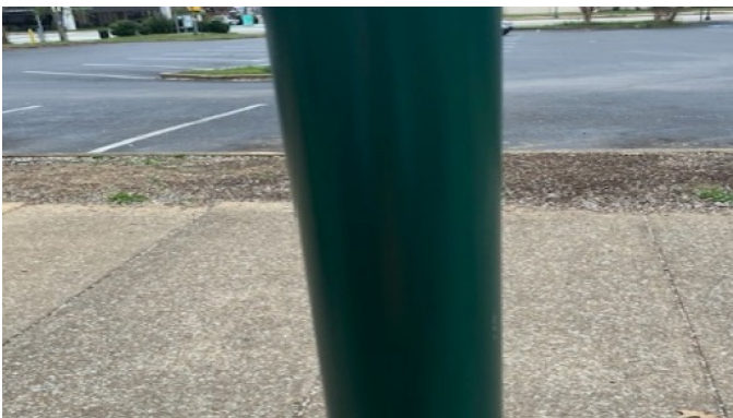
Flyer removed from light pole.