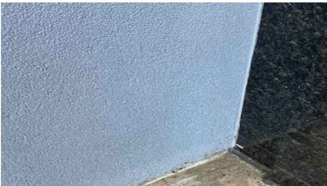
Biohazard removed from storefront.