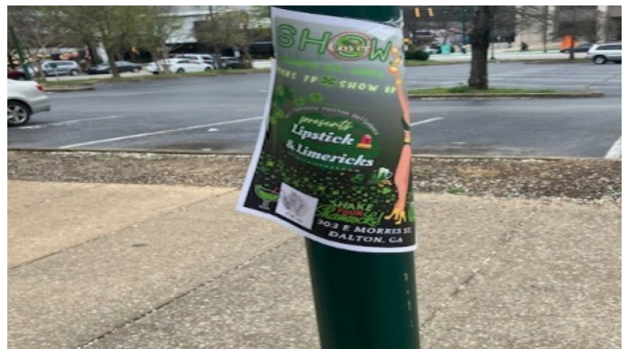
Flyer on light pole.