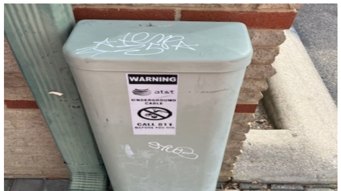
Graffiti on electric box Market St.