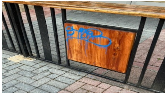
Graffiti on Market St.