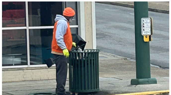
Hardy disposes of debris.