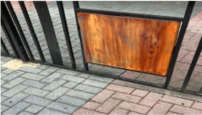
Graffiti removed on Market St.