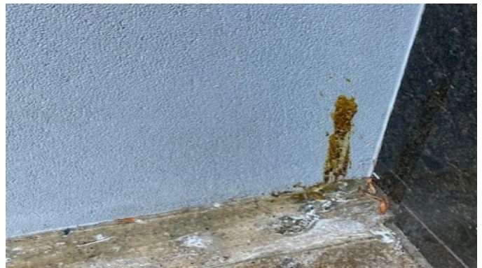
Biohazard on storefront.