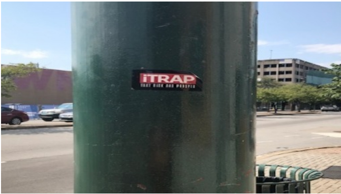
Sticker on light pole.