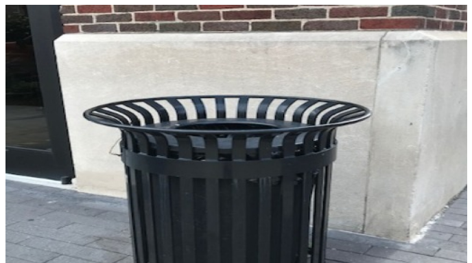
Trash can pulled on Chestnut.