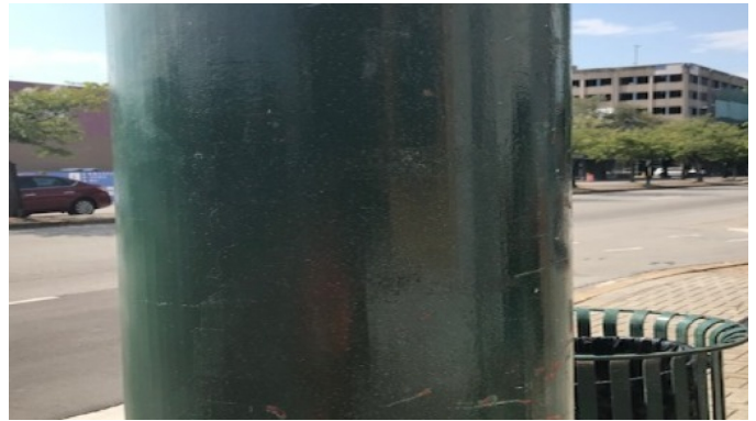
Sticker removed from light pole.