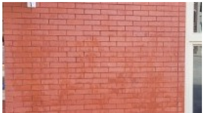
Graffiti removed from Loveman's Building.