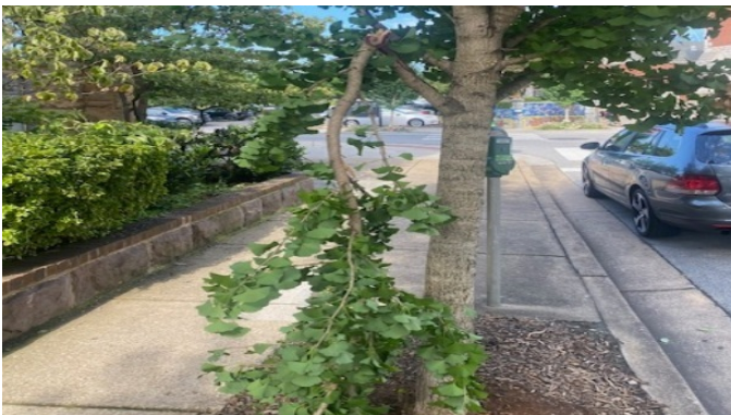
Damage tree limb on 7th St.