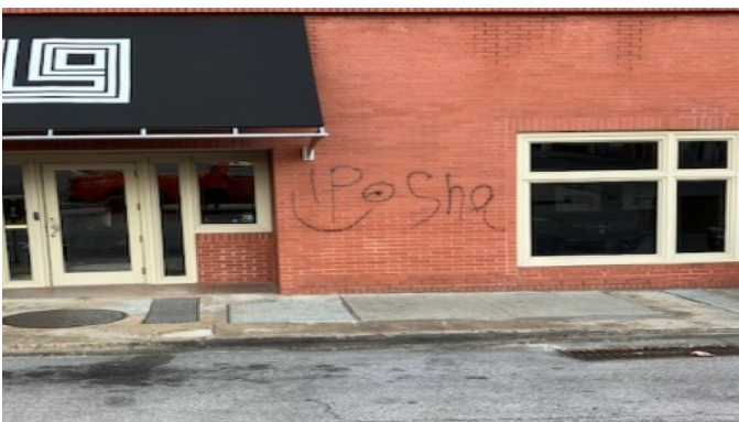
Graffiti on Loveman's Building.