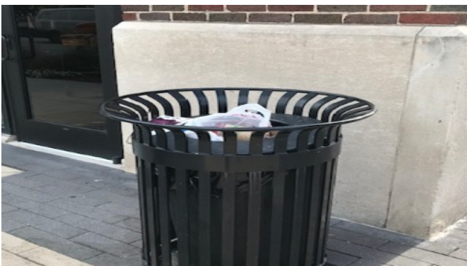
Trash can full on Chestnut St.