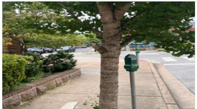
Tree limb removed on 7th St.