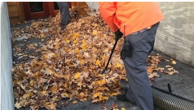
Leaves on Pine Street.