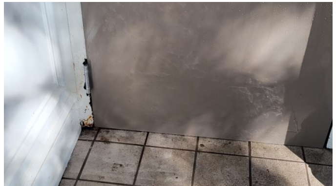
Biohazard removed from Broad Street.