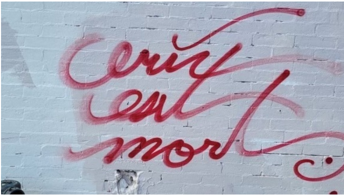
Graffiti on 5th Street.