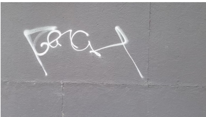
Graffiti on Market Street.