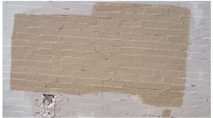
Graffiti removed from 5th Street.