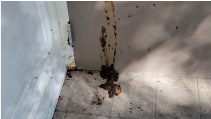
Biohazard on Broad Street.