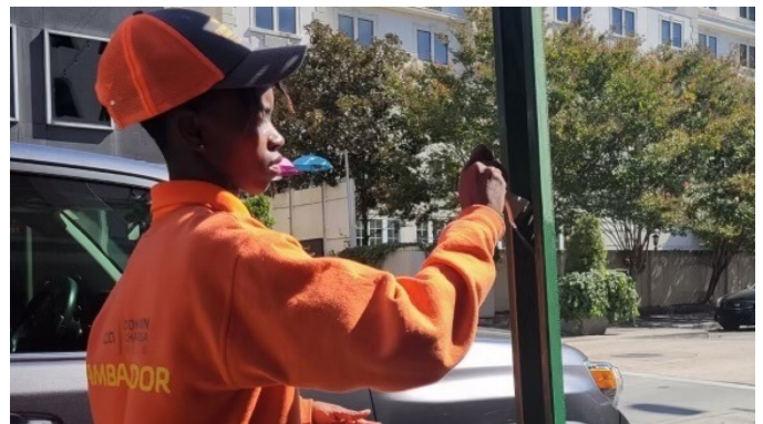
Ambassador Ty paints a street pole on Chestnut Street.