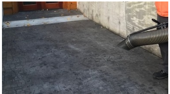
Leaves removed from Pine Street.