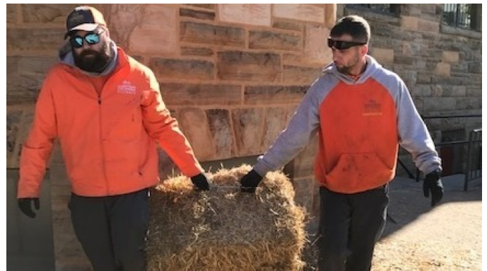
Ambassadors remove debris off Pine Street,