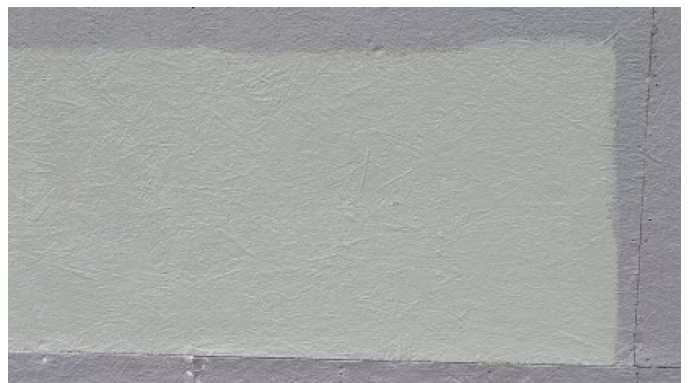
Graffiti removed from Market Street.