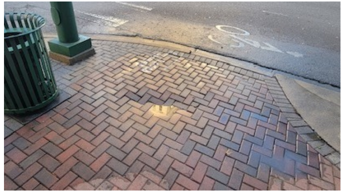
After photo of biohazard clean-up.