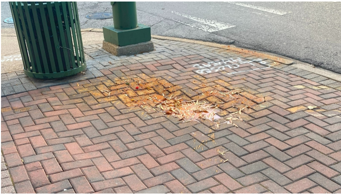
Before photo of biohazard on Broad St.