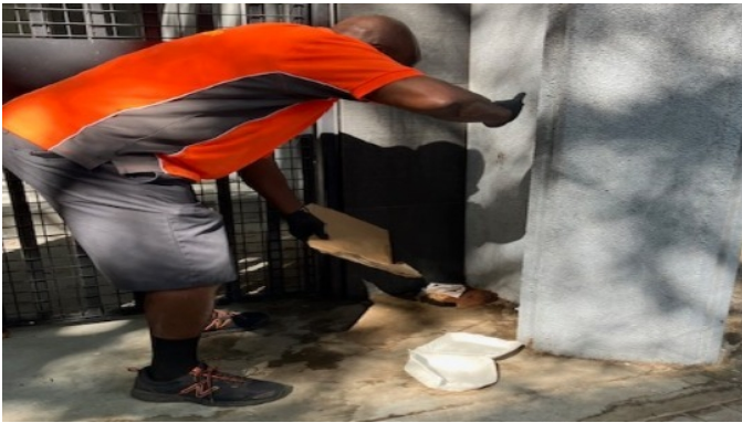
Hardy cleans up biohazard.