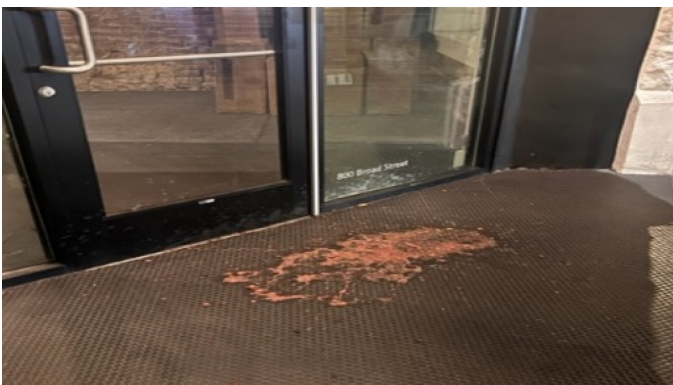
Before photo biohazard on Broad St