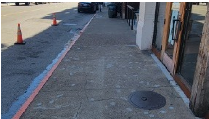
Before photo of Cherry St.