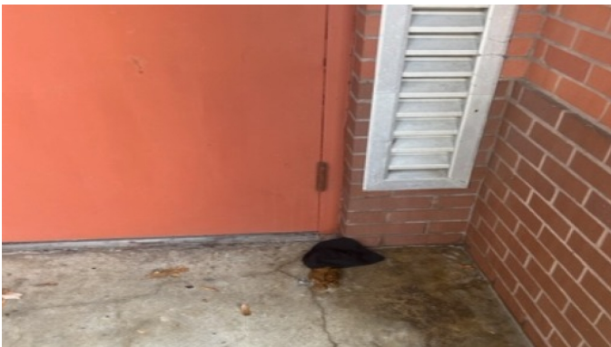
Biohazard on Market St.