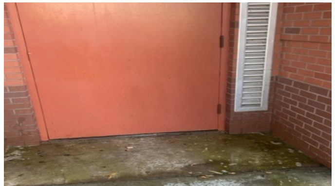
After photo of biohazard cleaned up on Market St.