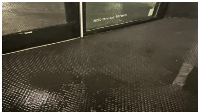
After photo of biohazard cleanup on Broad St.