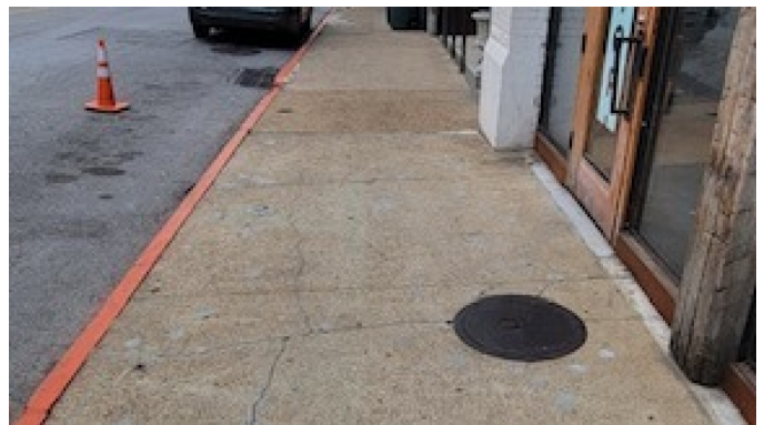
After photo of Cherry St power washed by DCA.