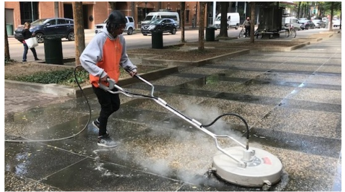
Ty surface scrubs Market St.